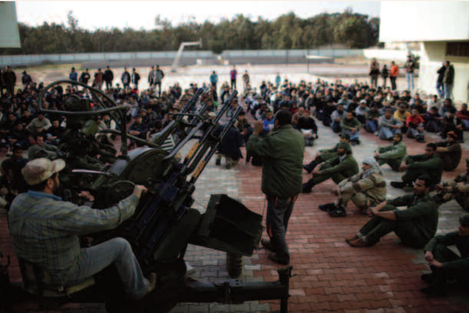
LIBYA: Rebel fighters are shown how to use an anti-aircraft gun during training held at a secondary school in Benghazi, Libya, on March 1, 2011.