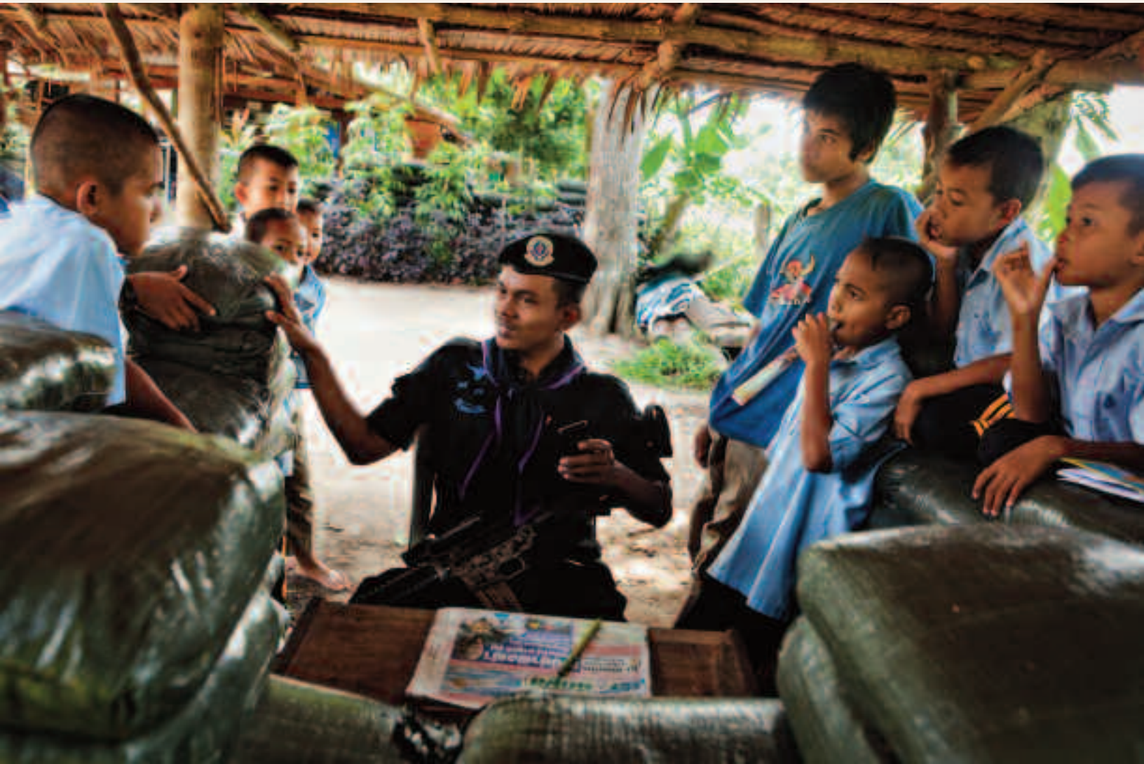
THAILAND: Students at Ban Klong Chang Elementary School, Pattani province, hang out with a paramilitary Ranger manning a sandbagged guard post in front of the Ranger camp in a corner of the school compound.