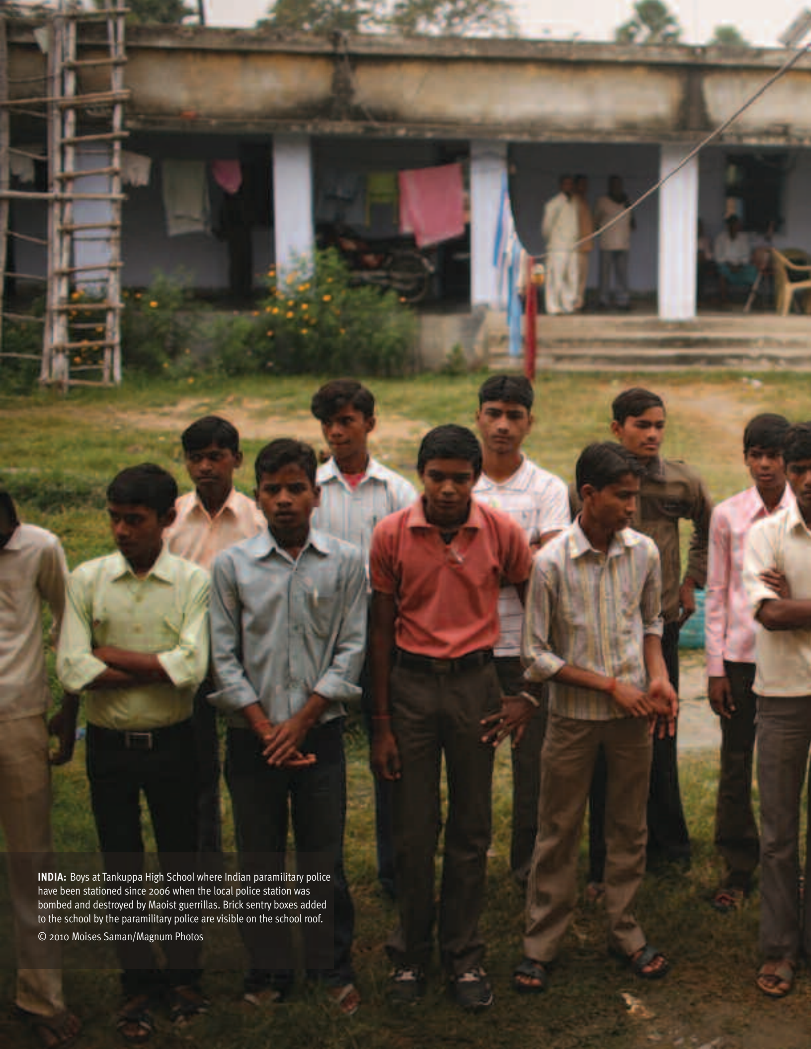
INDIA: Boys at Tankuppa High School where Indian paramilitary police have been stationed since 2006 when the local police station was bombed and destroyed by Maoist guerrillas. Brick sentry boxes added to the school by the paramilitary police are visible on the school roof.