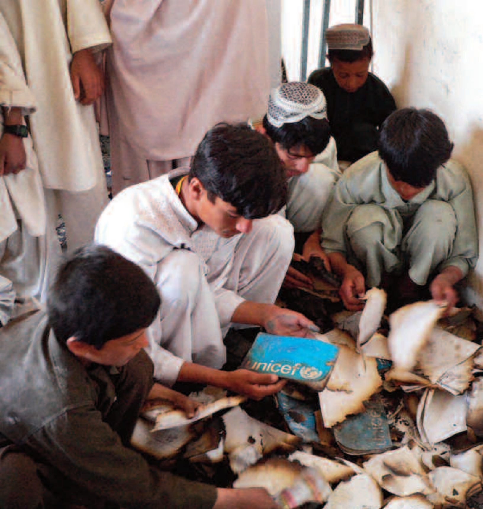
AFGHANISTAN: Afghan students inspect burnt books in a classroom in Kandahar on March 15, 2008. The school was set ablaze by militants the day before.