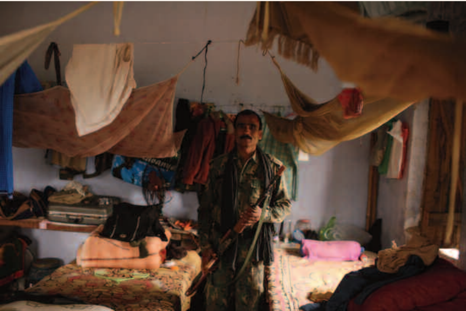
INDIA: A squad of Indian paramilitary police has been stationed inside the Tankuppa High School since the local police station was bombed and destroyed by Maoist guerillas in 2006. Tankuppa, Gaya district, Bihar State, India.