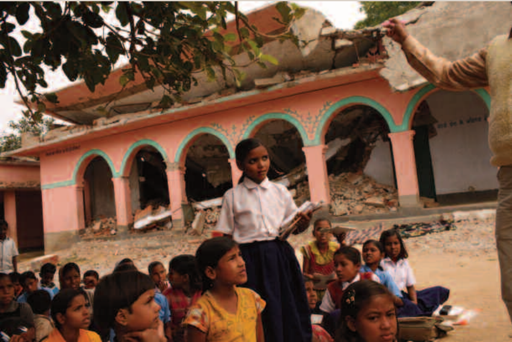
INDIA: Schoolchildren sit in a makeshift classroom in the courtyard of the Birhni Middle School in Birhni, Aurangabad district, Bihar State, India. The school was bombed by Maoist guerillas on December 27, 2009. Maoist guerillas have been responsible for several attacks on public schools and other government buildings in this district, harming access to education to thousands of children.