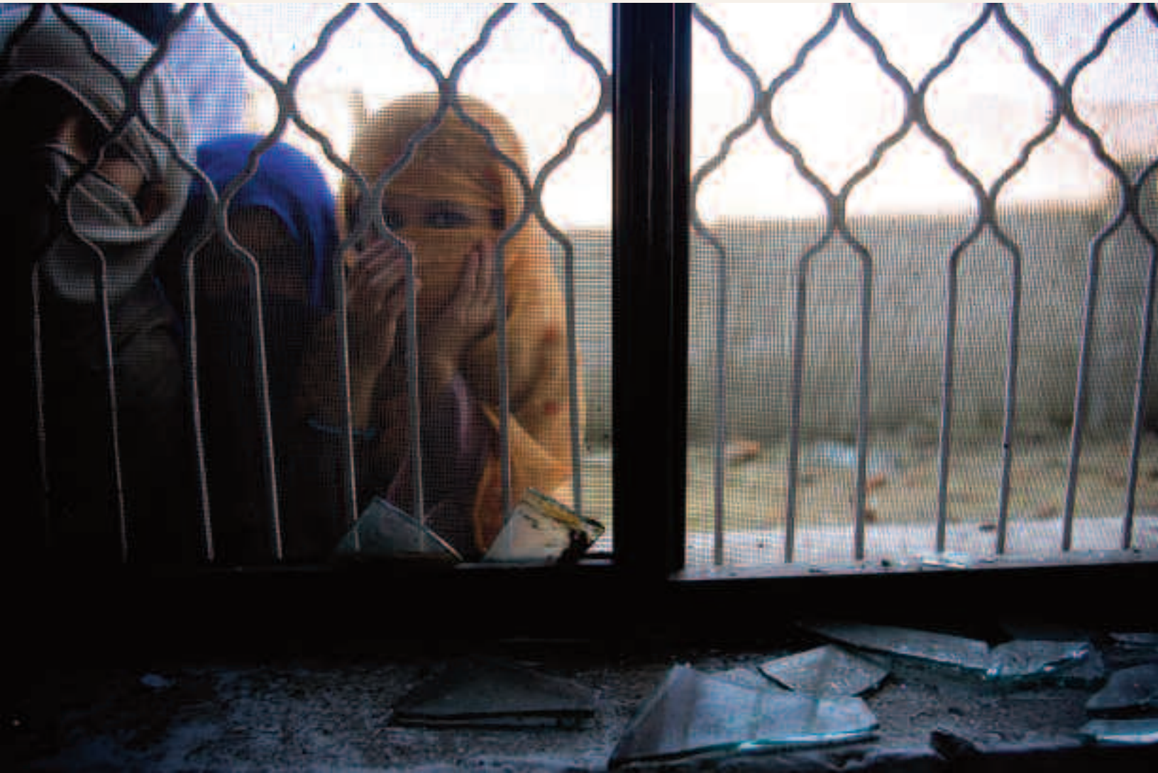
PAKISTAN: Girl students look through a window at the damage to their classroom at Hathier High School in Mardan, North-West Frontier Province, Pakistan. The school was bombed on March 22, 2009 by Taliban militants opposed to female education.